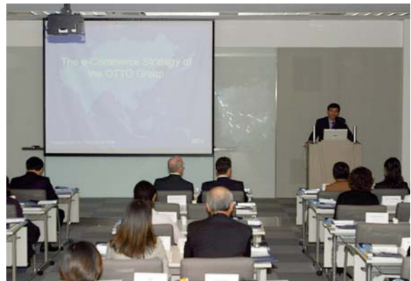
"Bolero Rollout in Korea" seminar underway Apr. 28 at WTC Seoul.

The world's largest mail order enterprise, Otto Group, plans to use an e-trade system for trade with Korean apparel suppliers. The group has reportedly decided to adopt the system to maximize work efficiency and cut cost in worldwide sourcing of products and shortening of business processing time.